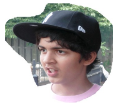
Life is Nature Sudin

for an expensive $499.99. For the Wi-Fi + 3G, it requires a 3G plan from AT&T. Two plans are available - the $14.99 a month plan and the $30 a month. The $14.99 plan gives you 250 megabytes a month, while the $30 a month plan gives you unlimited data a month.